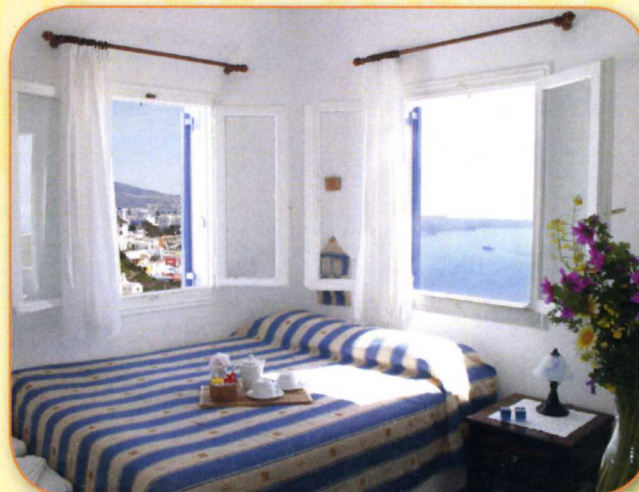
cozy bedrooms 'above' the clouds