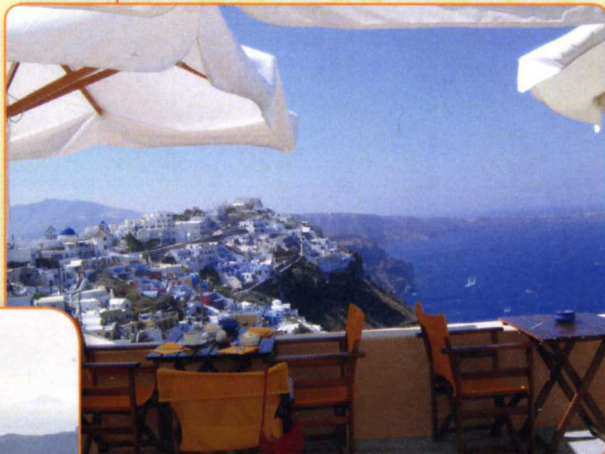
breathtaking breakfast view...

Focus: we implemented the versatile Criteria's of Qi-Mag® Feng Shui, and applied Geomancy, into the renovation process of an old hotel-building on the island Santorini. To create a 'feel-well'-atmosphere of relaxation and abundance - To increase the quality of concept and design of touristic facilities. with the goal to provide a place for the guest, that suggests recovery, and rest on a holistic level.